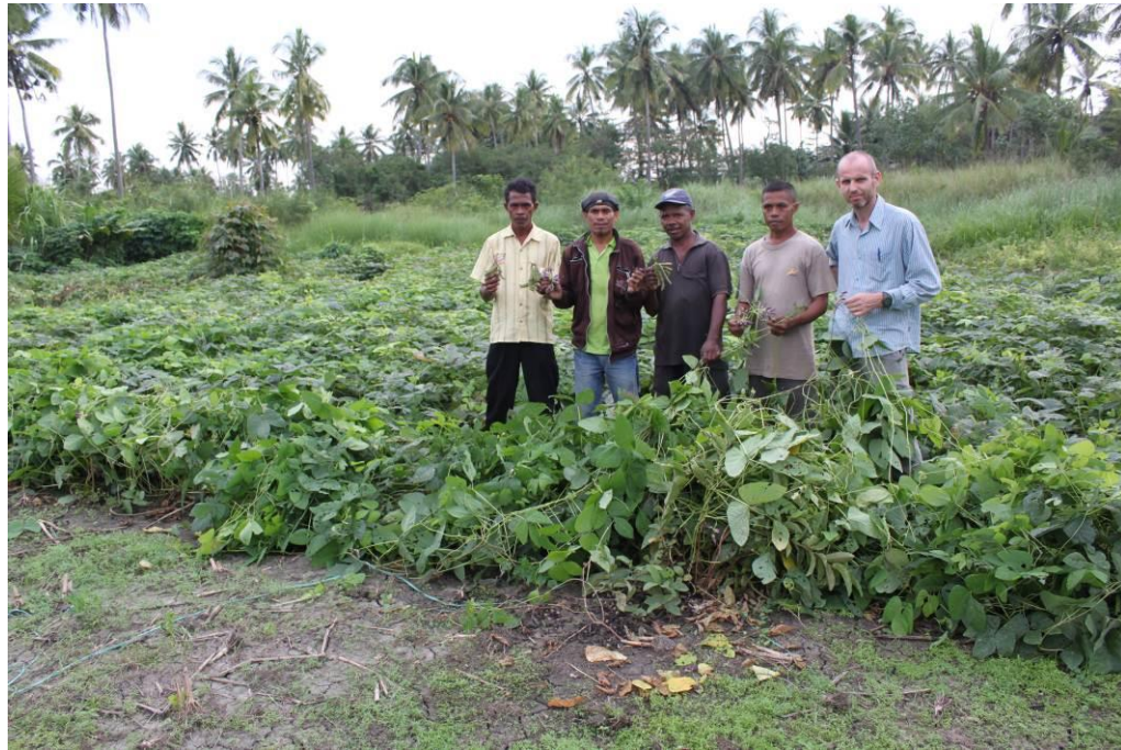
Excellent growth of velvet bean at Viqueque site in June 2012.

This site had velvet bean grown amongst a corn crop last wet season. After the corn harvest, the velvet bean was left to smother the corn stalks. As on June 13 2012, there was considerable growth of the velvet bean, as seen in photo below. This will be planted to corn next wet season.